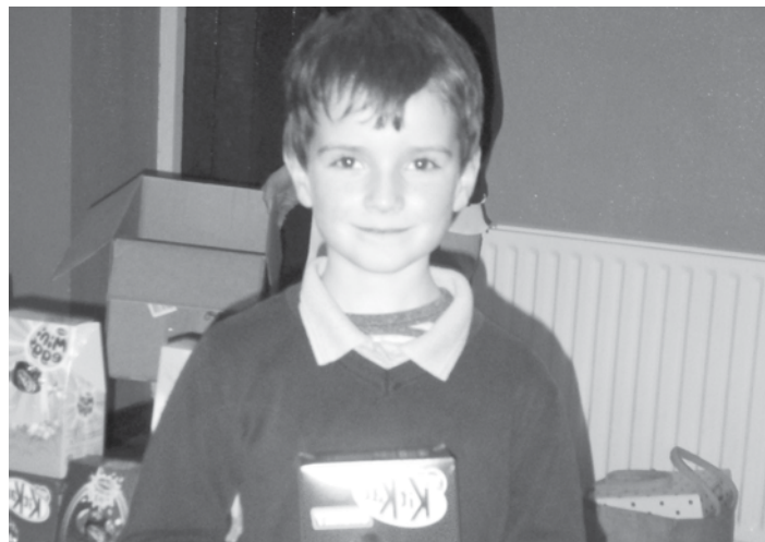
A happy winner at Oxmantown School Easter raffle

The Parents' Association organised an afternoon of bag packing at Super Valu Birr to raise much needed funds for the School. We are very grateful to the parents who helped to organise this and to those who rolled up their sleeves and packed up the groceries!