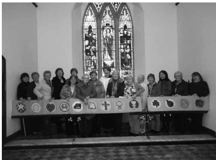
The Circle Club with the kneeling cushions in Croom church