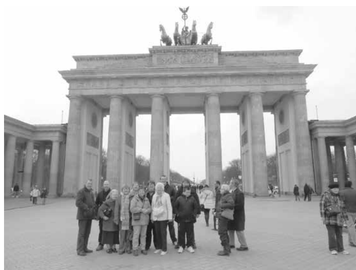
Visiting the Brandenburg Gate, Berlin

A full report on the recent parish visit to our link church in Harzgerode will appear in next month's Newslink. Meanwhile some photographs from the trip can be seen on the parish website - http://shinrone.blogspot.ie/p/blog-page_19.html