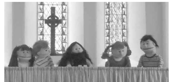
St Patrick's Puppets