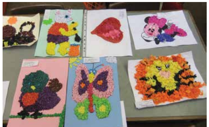
Tissue paper pictures crafted by girls aged 3 & 4