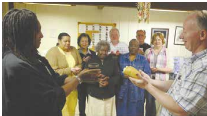
A different way of celebrating – Eucharist at Koinonia Farm Christian community in Georgia

Most parishioners are familiar with how the Eucharist is celebrated in their own parish church, but each Christian community should find a way to gather around the Lord's Table that is appropriate to the size of their community and the architecture of their church building. Standing or kneeling, or seated around a table are all appropriate in different situations. The important thing to remember is that word, "celebrate". The Eucharist is not some solemn ritual we do as our duty – it is a celebration of the presence of Christ in our church and in our hearts. May we take part joyfully as well as reverently, as we would for any family celebration.