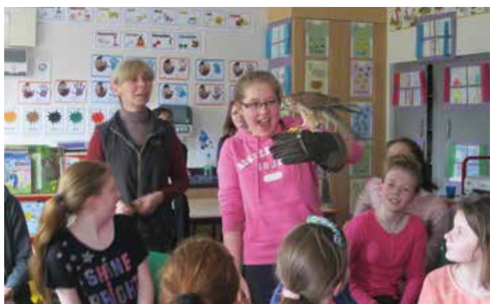
Looking a kestrel in the eye!

We welcome our new pupil Braydan to second class. Braydan joined us following the Easter break. A reminder that the closing date for applications for September 2013 of 30th April is fast approaching.