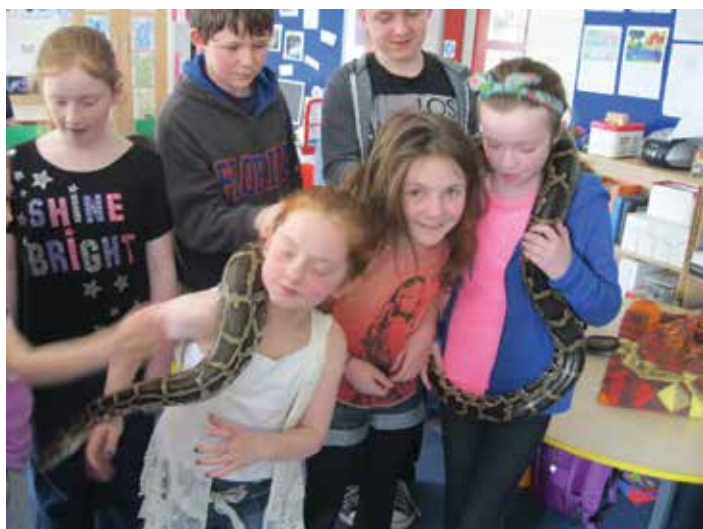
The python - fainting in coils!