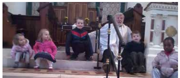
Easter Egg makers at work