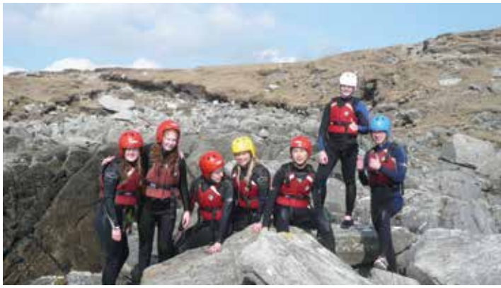
Adventurers in Achill