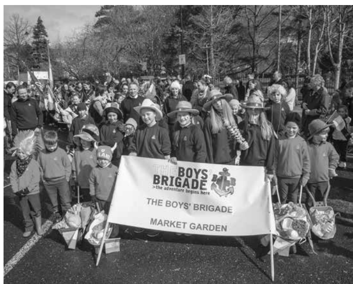
At Tralee St Patrick's Day Parade

We joined in the Tralee St Patrick's Day Parade. This year their theme was "Market Gardening" and the Girls and Boys had decorated their wheelbarrows with fruit and vegetables which they pushed through the parade.