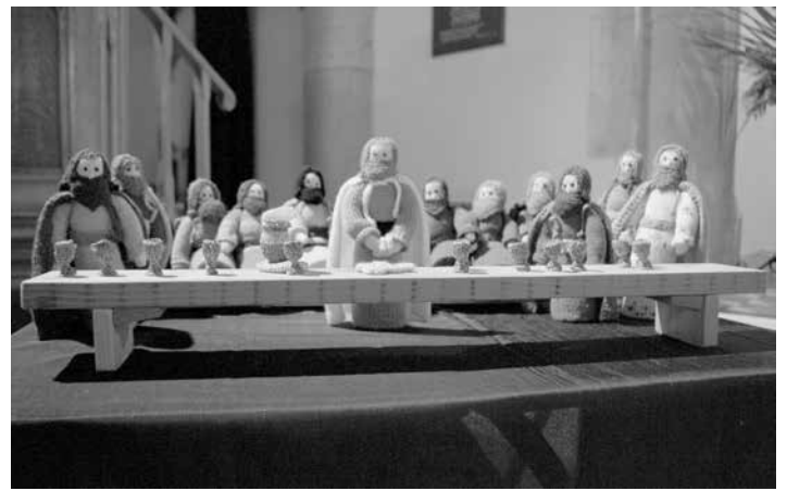
The knitted Last Supper – a work of art!