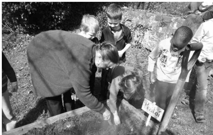
Planting potatoes in Adare