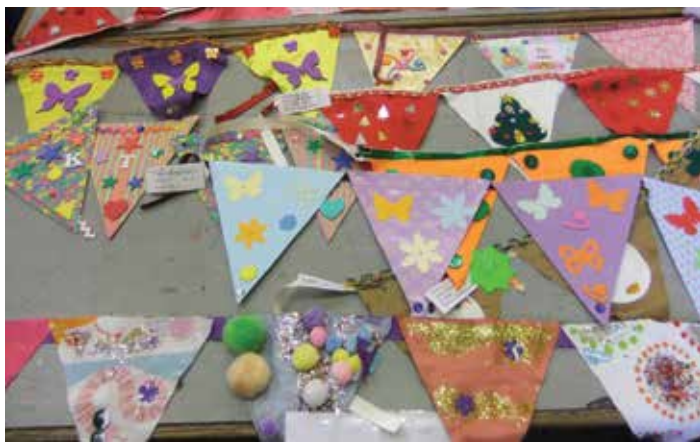
Banners crafted by girls aged 5 & 6