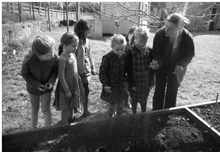
Spring planting in St. Nicholas' NS

The school is participating in the Active School Flag initiative and we look forward to a busy term with lots of activities planned.