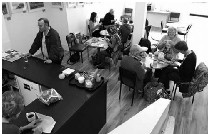
Knitters 4 Life exercising their skills

are very simple ideas – knit, crochet and craft together on one and speak and listen to each other so that migrant members of our community can improve their English skills on the other. There has also been some connection where people have found out about one opportunity while they've been participating in the other. That is of course our 'dream' result – Connecting Community Life.