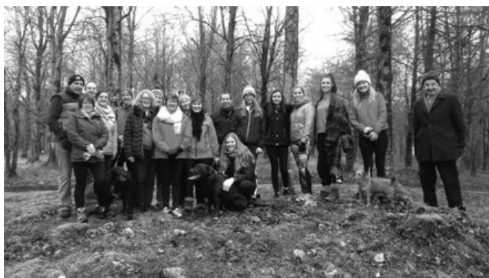
St Stephen's Day walk in Curraghchase

And we had the traditional walk in Curraghchase (to walk off the turkey, not to mention all the other Christmas goodies...) on St. Stephen's Day.