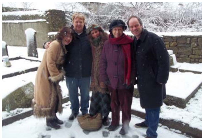
Braving the elements!