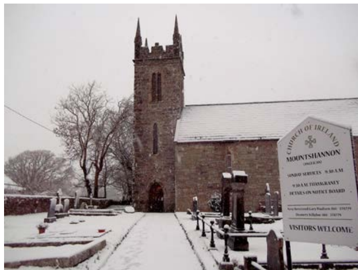
Snow covered Mountshannon Church