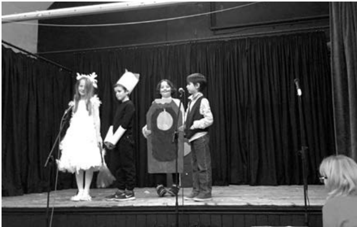
Some fun on stage in St. Nicholas' N.S.

The Christmas party is a much-loved event in school when all three classrooms entertain parents, grandparents and friends with a selection of plays and musicals. This year the junior room performed 'Have you seen my Little Lamb', followed by the middle room with their version of 'Beauty and the Beast'. The afternoon finished off with 'Fee, Fie, Foe, Fum' by the senior pupils. As always the audience were delighted with the performances. This was followed by refreshments supplied by the Parents' Association and a visit from Santa. This year he arrived in his raincoat and wellington boots!