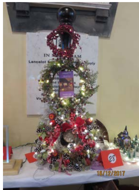
Peppermill Garlands, by Peppermill Restaurant, Nenagh