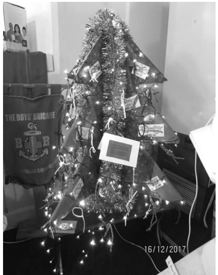
The Croft Knot Tree