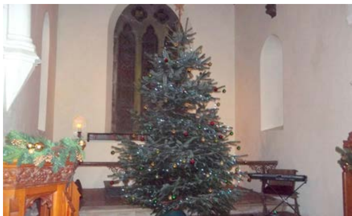
Clonlara's Christmas Tree