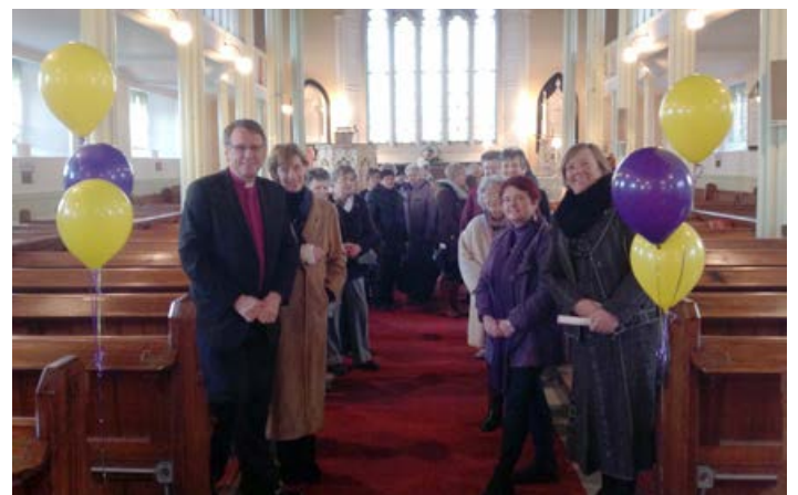
In St Cronan's Church, Roscrea for the Vigil against gender based violence