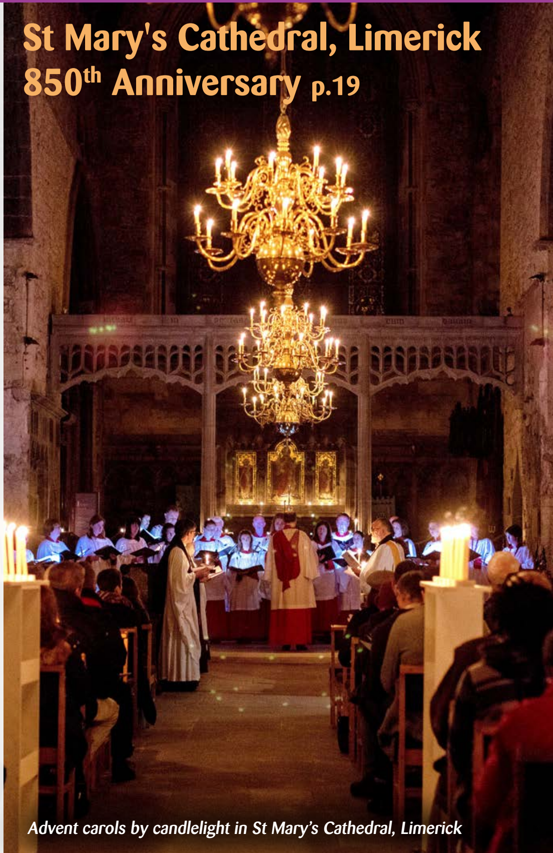
Advent carols by candlelight in St Mary's Cathedral, Limerick