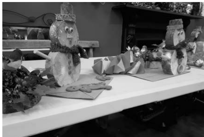
Children's Christmas crafts