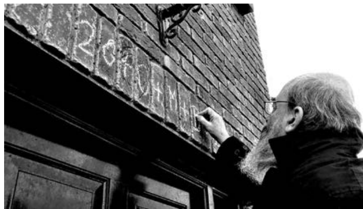
Chalking the traditional Epiphany blessing above the door at the Rectory in Askeaton