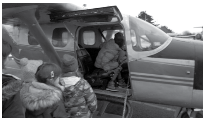
Exploring a plane in Shannon

Second Class had the privilege of visiting Atlantic Airventure in Shannon, Co Clare, in January to learn all about planes and flight. Having an opportunity to experience a flight simulator was very exciting, as was seeing several planes up close.