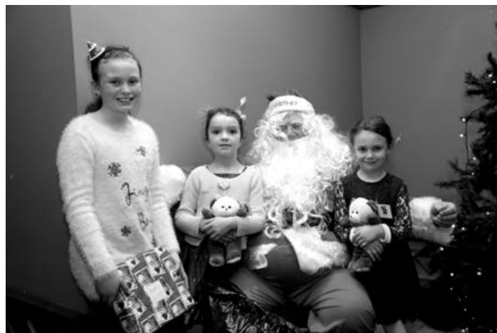
St Nicholas aka Santa joined in the fun