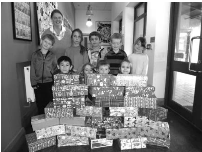
Christmas shoeboxes from Adare