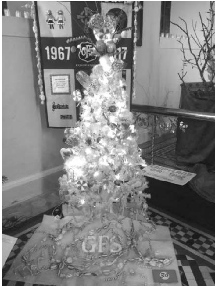
Candyland Christmas Tree

Once again GFS presented a magnificent tree. The Diocesan tree was voted second favourite in the Organisation section. Girls created the 'Sweet' decorations for the tree at the Christmas Craft Day. Well done to everyone involved in a beautiful creation but special thanks to Diane Dagg for leading the group. Thanks to everyone who visited the Festival and voted for the GFS tree.