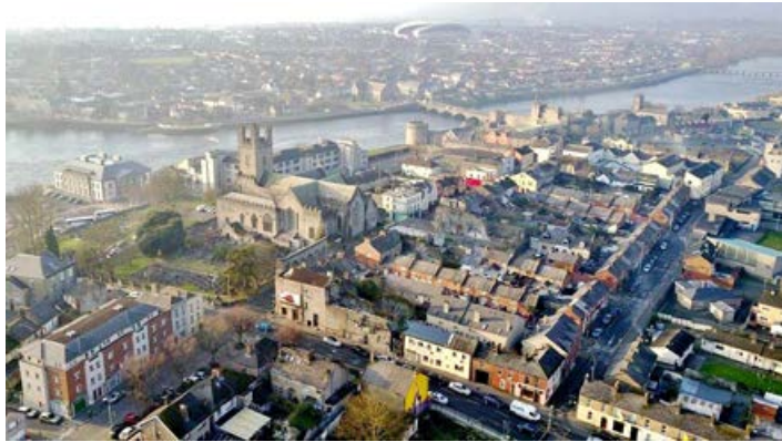
St Mary's Cathedral is at the heart of Limerick City