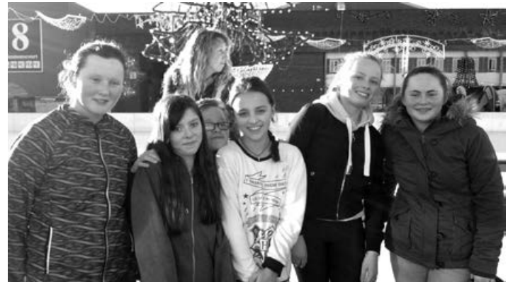
Ice Skating & Funderland at RDS, Dublin

A very large group (67 in total) of young people headed to Dublin on Thursday 28th December for an action packed splendid day that included I-SKATE on Ice @ R.D.S., Funderland @ R.D.S., Jumpzone Indoor Trampoline Park @ Stillorgan Industrial Park, Fast Food @ McDonald's Kylemore, Karting @ Kylemore Karting. It was really great to have everyone on the trip with many new faces and of course the UDYC regulars. We hope to see everyone again real soon.