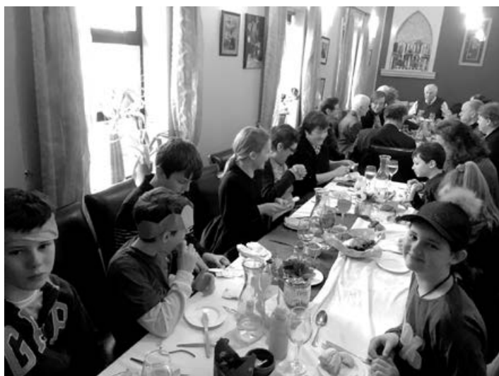
Kilmallock Christmas Dinner

Kilmallock had a Carol Service on 17 December in which the children read the readings and built the nativity scene as part of the service. This year we had a Christmas dinner afterwards at the Bulgaden Lounge. It was an enjoyable and festive occasion.