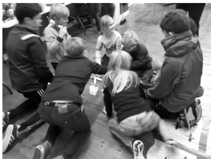
Enjoyment at Shinrone's Children's Christmas Party

Thank you to those who supported the Christmas Whist Drives in Shinrone and Aghancon and who gave prizes and supplied the refreshments.