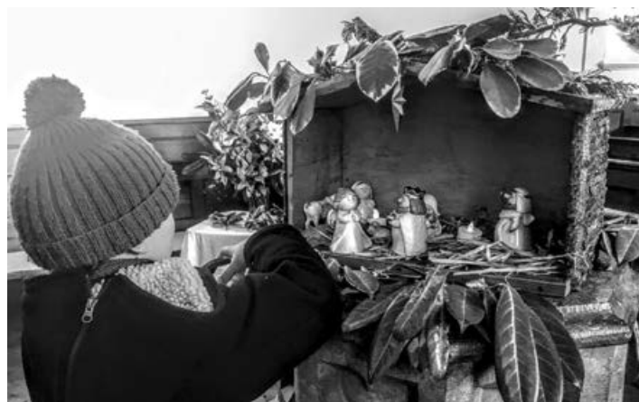
The Three Wise men arrive at the crib in Saint Mary's Church, Askeaton

Epiphany was marked in a new way this year, drawing on old traditions, when the lintels of rectory doors were chalked with the traditional Epiphany blessing 20 + C + M + B + 18, representing the numerals of the year, the initials of the Three Wise Men or Magi – Caspar, Melchior, and Balthazar – who came to visit the Christ Child in his first home, and abbreviating the Latin blessing, Christus Mansionem Benedicat , 'May Christ bless the house.'