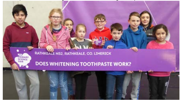
Pupils at the Science Fair

We entered the RDS Primary Science Fair held in Limerick on Friday 19th January with our investigation "Does whitening toothpaste work?"