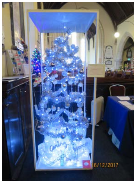
The invisible Tree, by St Cronan's Services