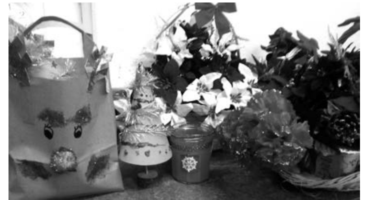
Display of Christmas Crafts

was a great opportunity to renew friendships with other branches. Many thanks to Birr Leaders and friends for hosting this event and providing lovely refreshments.