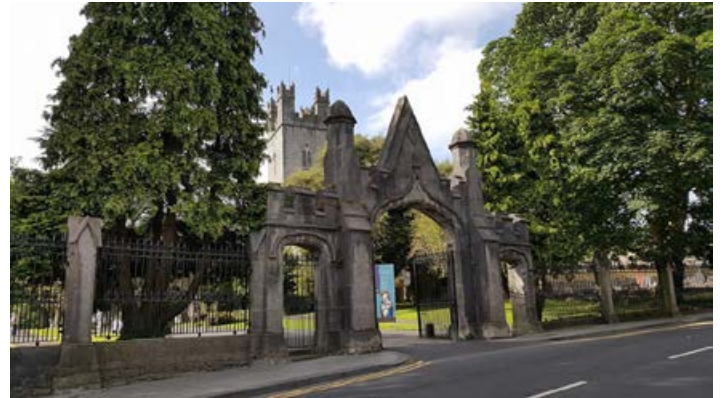
St Mary's Cathedral opens its doors to all

The year's festivities will celebrate and promote the Cathedral's roles in city life including - community, civic, cultural, educational, ecumenical, musical, sporting and tourism. Highlights of the year include a visit from the Choir of King's College, Cambridge and a special Service of Thanksgiving. Each month the Cathedral will highlight a figure associated with Saint Mary's and there will also be a tangible dimension to the celebrations as each month will focus on a charity or cause based in or around Limerick.