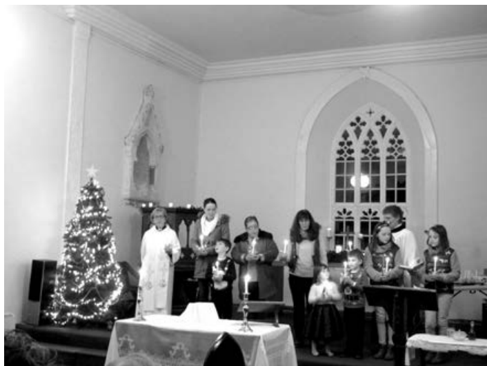
Christmas Eve in St James' Dingle