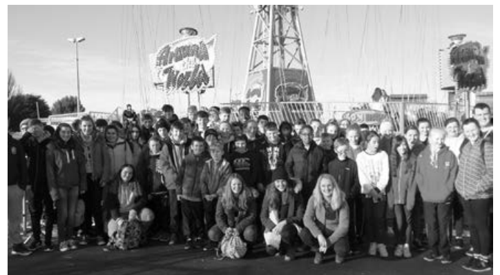
Mega Group at Mega Christmas Day Trip to Dublin