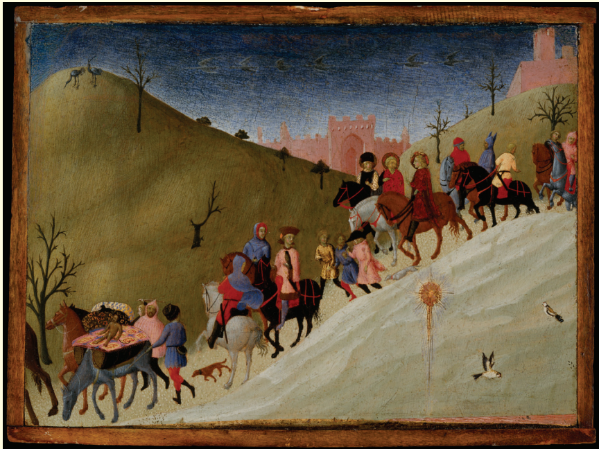
Illustration of a Pilgrimage

Journey of the Magi , by Stefano di Giovanni, the leading painter of fifteenth-century Siena, Italy, shows the three magi (the Wise Men or Three Kings) journeying to Bethlehem to worship Christ. It is a fragment from a small altarpiece showing the Adoration of the Magi. Originally, the star was shown above the tiled roof of the stable. The fur-lined hat worn by the magus in pink was inspired by the visit to Siena in 1432 of King Sigismund of Hungary. The picture may date from about 1433–35. For more information about this painting and the other panel from the altarpiece, visit metmuseum.org .